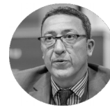
Carlos Trias Pintó European Economic and Social Committee Circular Economist